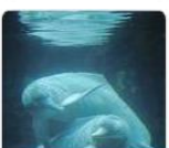
Amazon river dolphin