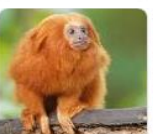
Golden lion tamarin