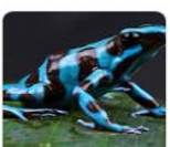
Poison dart frog