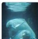
Amazon river dolphin