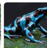
Poison dart frog