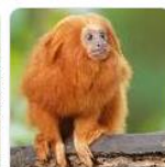
Golden lion tamarin