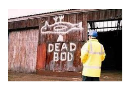
Dead Bod image