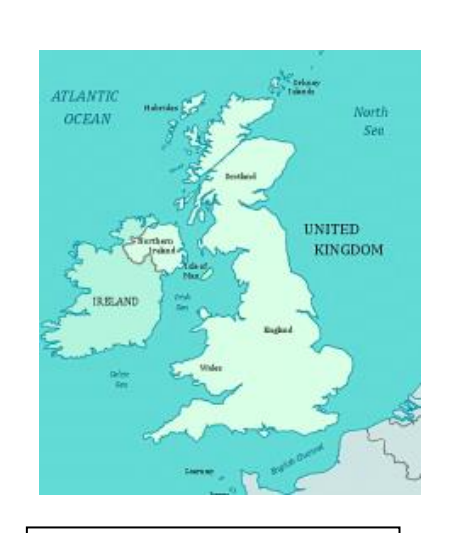
Map of the United Kingdom