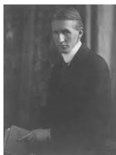
Charles Livingston Bull