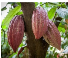
Cocoa pods growing on trees.