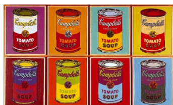
Andy Warhol 'Soup' pop art.