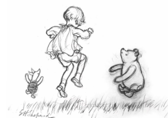
E. H. Shepard illustration