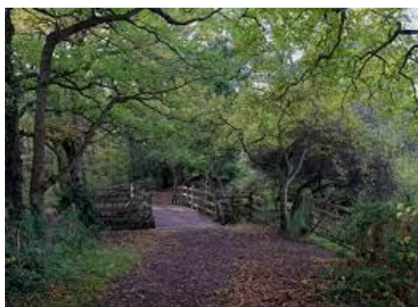
Ashdown Forest which is the setting for Hundred Acre Wood