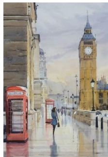
Examples of atmospheric paintings