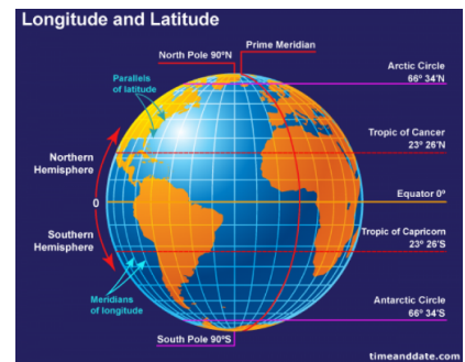
Longitude and Latitude