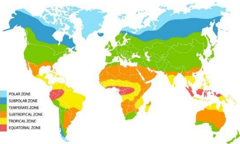
World Climate Zones