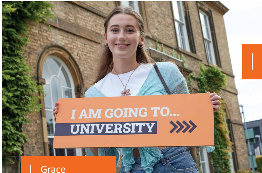
Grace Northumbria University